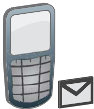
Email Alerts and SMS (text) Alerts