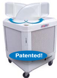
WC-1HPMFOSC Spout oscillates 120°