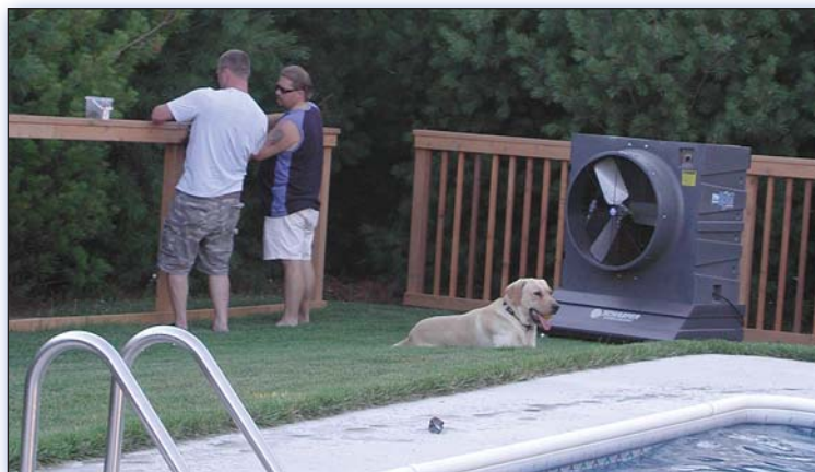
Pro-Kool® Evaporative Coolers can reduce air temperature by as much as 20°F!