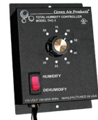
THC-1 Humidity Controller