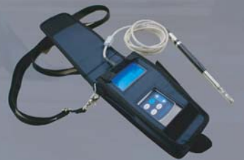
Hands-free Case now available!