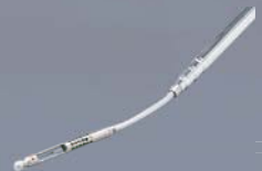
Telescopic, articulating probe