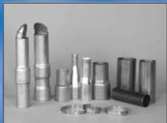
Wall & Hose accessories