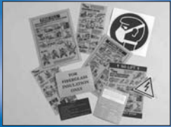
Instruction, Warning labels