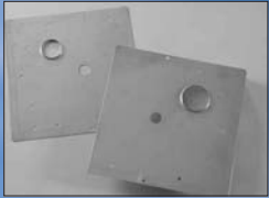
Airlock, stainless steel inserts