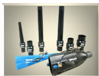
Nozzles & Swivel Hose Connectors