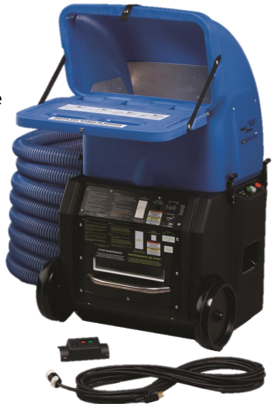
System shown with standard wireless remote, LED power cord, & 100 feet of hose.

The wireless remote enables operation from the installation location without the requirement of taking a cord with you.