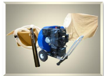
Vacuums & Generators