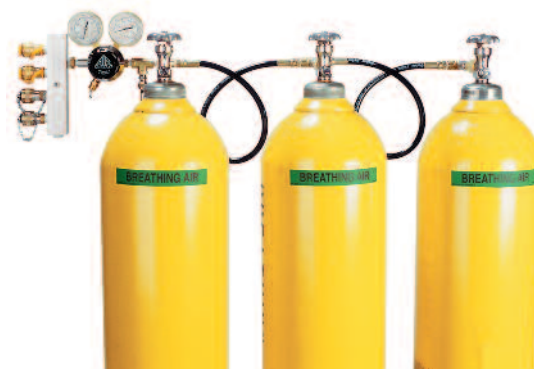
CBA3-346NB Cylinders Not Included

Additional Breathing Air Assemblies Available. Contact Our Customer Service Department.