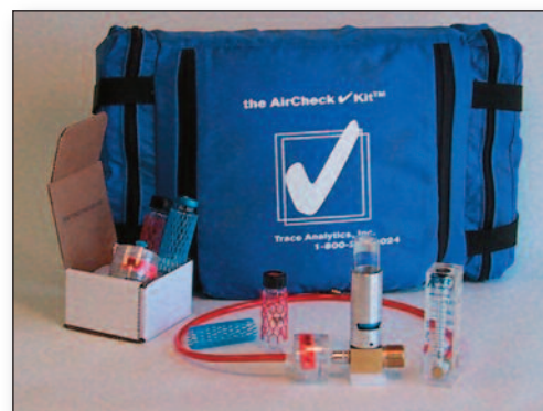
ACK-97 & AQT-1LS