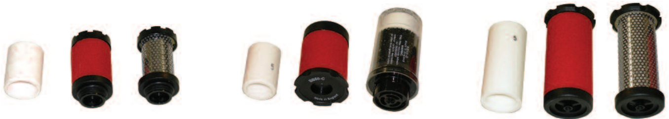
BB30 Series Filters