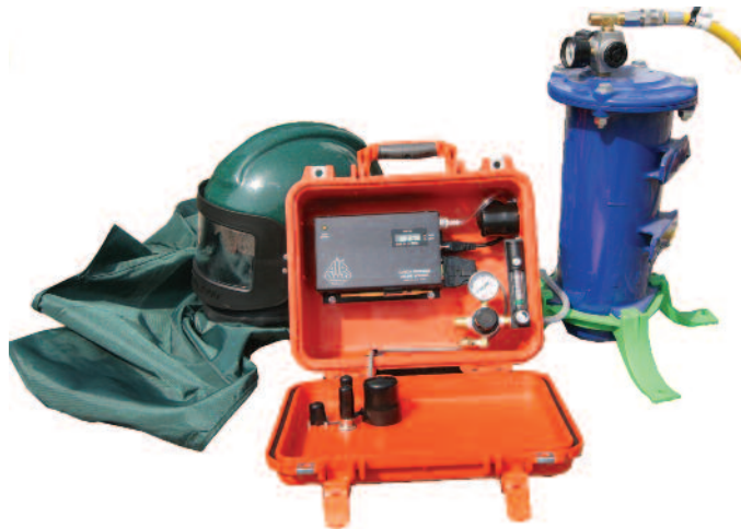
CO91-14LAC Portable CO Monitor