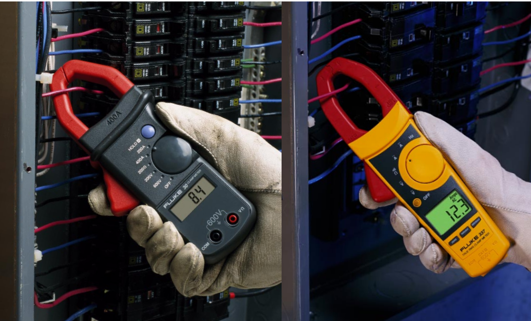
Figure 1. One current—two readings. Which do you trust? The branch circuit above feeds a non-linear load with distorted current. The true-rms clamp reads correctly but the average responding clamp reads low by 32 percent.