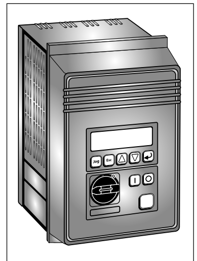
Figure 3. An adjustable speed motor load.

Non-linear loads that cause measurement errors.