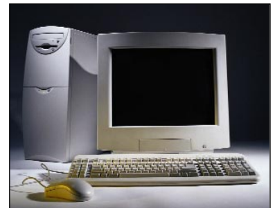
Figure 2. A computer load.

Your first instinct will probably be to measure the current with a current clamp while the load is on. If the current is within the circuit rating, you may be tempted to replace the circuit breaker.