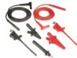
Test leads for Model 1039 Catalog #2119.40