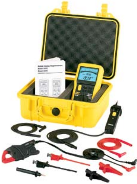
Model 1039 Field Kit, Catalog #2115.43