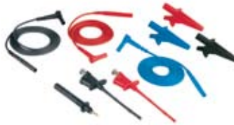
Test leads for Model 1035 Catalog #2119.41