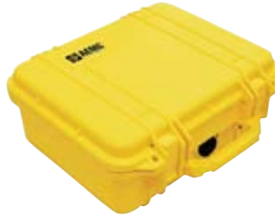
Field case for use with all models Catalog #2118.98