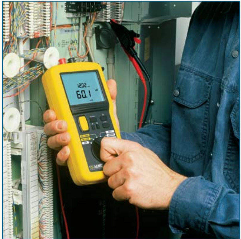
Safety rated 1000V clips provide quick and easy connection of test points for the Model 1039.