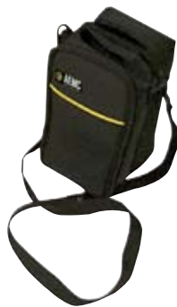
Hands-free carrying case for use with all models Catalog #2118.99