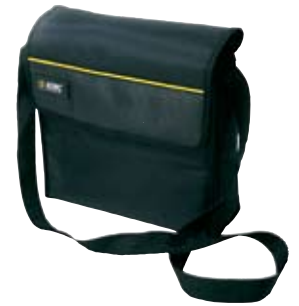
Soft carrying case included with standard megohmmeter models Catalog #2119.02