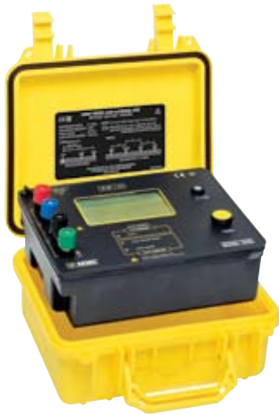
The Models 4620 and 4630 are built into a double case. This extra rugged construction provides double insulation, maximum field durability and ease of serviceability.