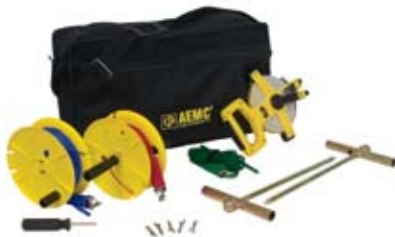
Test Kit for 3-Point testing includes two 150 ft color-coded leads on spools (red and blue), one 30 ft lead (green), two 14.5" T-shaped auxiliary ground electrodes, one set of five spaded lugs, 100 ft tape measurer and carrying bag. Catalog #2135.35